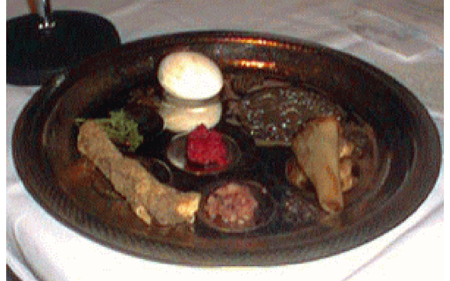
The Pesach (Passover) Seder Plate (for the Pesach Meal)

G-d declared Passover (Pesach) to be a permanent celebration for all